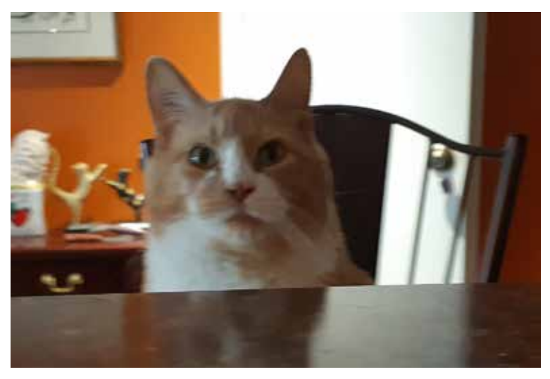
New Tricks to Get Treats

If the furniture has been re-upholstered, take the time to be sad about all of the improvements you made to the old upholstery that now are lost. Be careful not to restart your work too soon. Live with it for a while to determine where it is most lacking so that you can prioritize properly. This also gives your human a little while to get over it being new so she or he will be more open to the upgrades you make later.